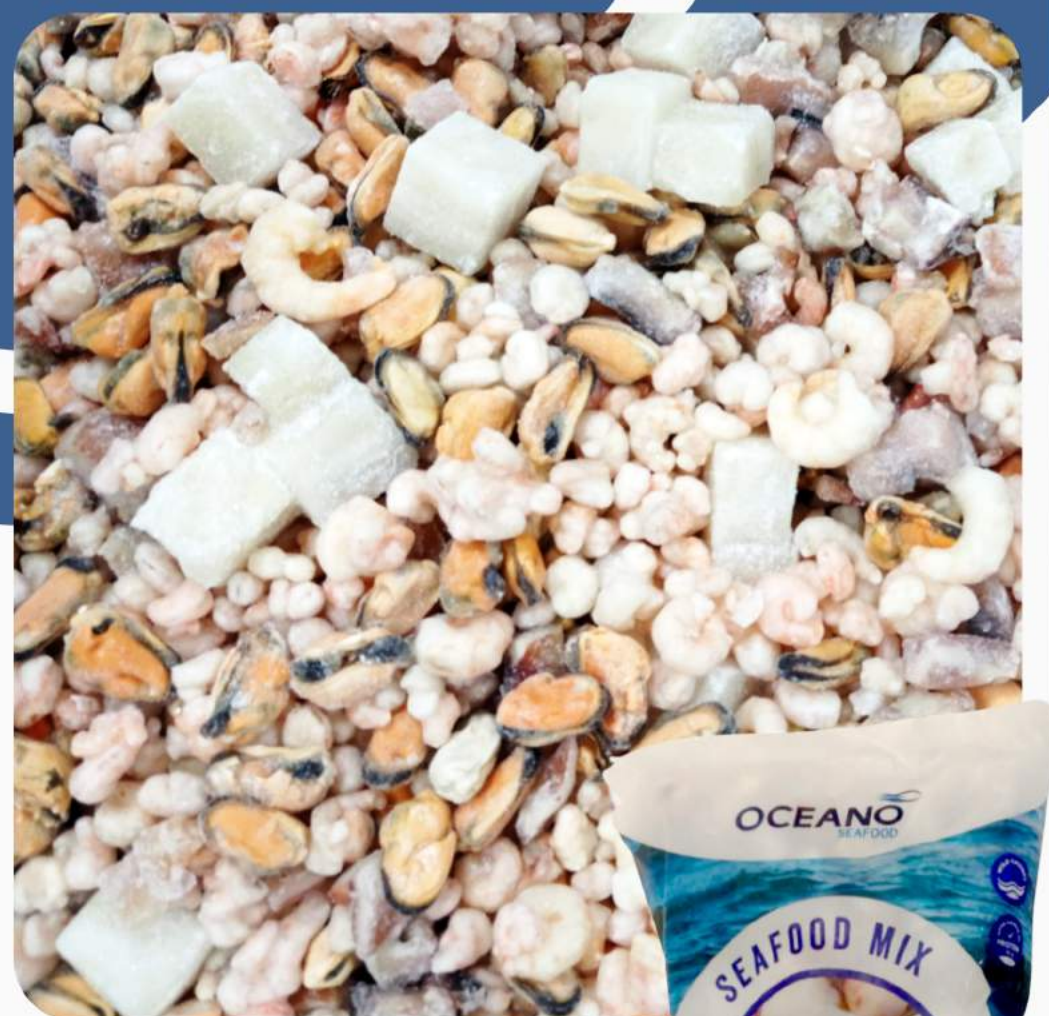
Peruvian Seafood Mix, fully customizable.